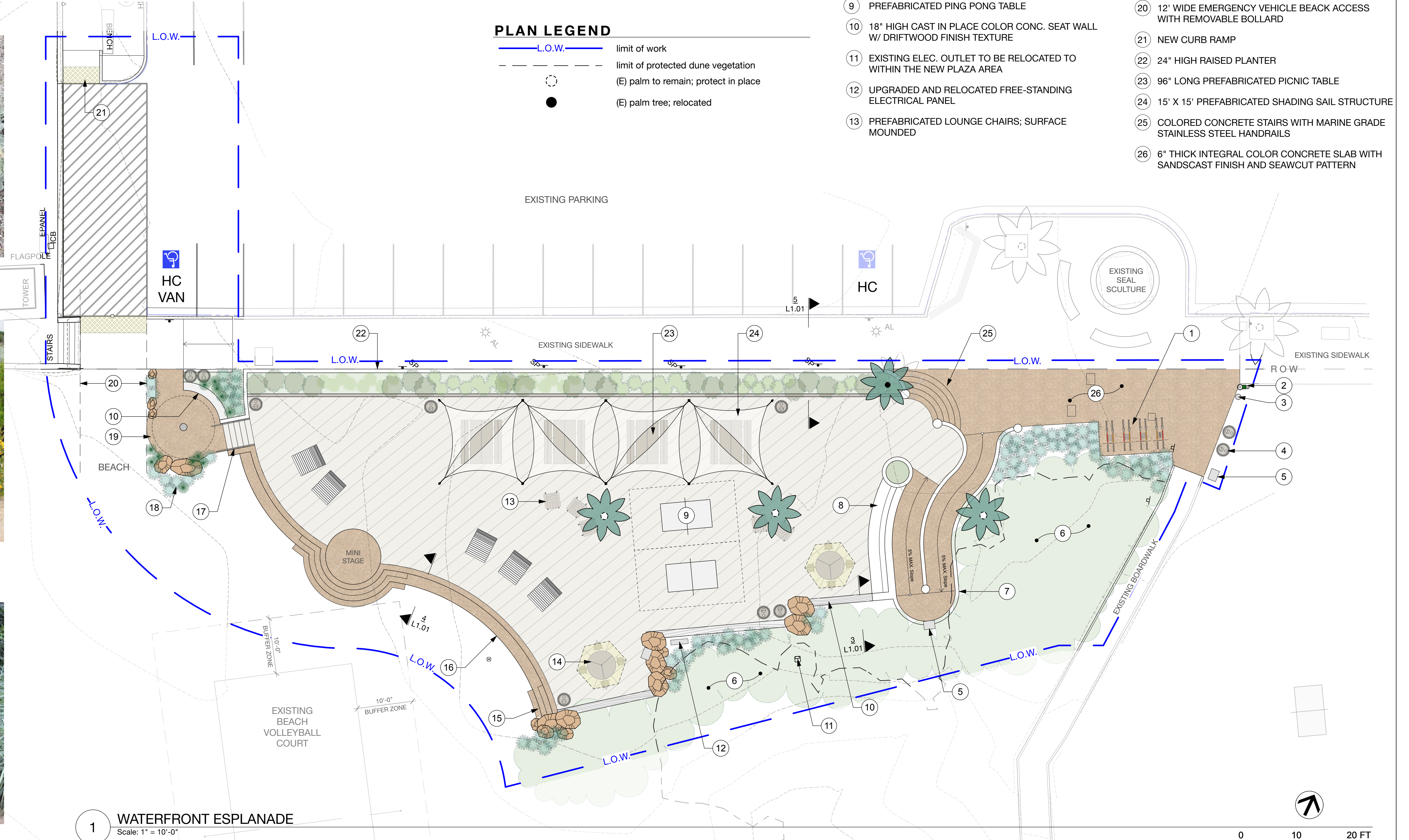
1 WATERFRONT ESPLANADE Scale: 1" = 10'-0"