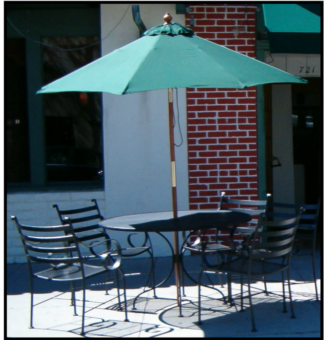
Figure 3 - Table, chairs and umbrella constructed of durable painted metal.