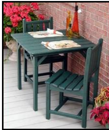
Figure 4 - Table, and chairs constructed of durable painted material

for safety and aesthetics and require separate building permit review.