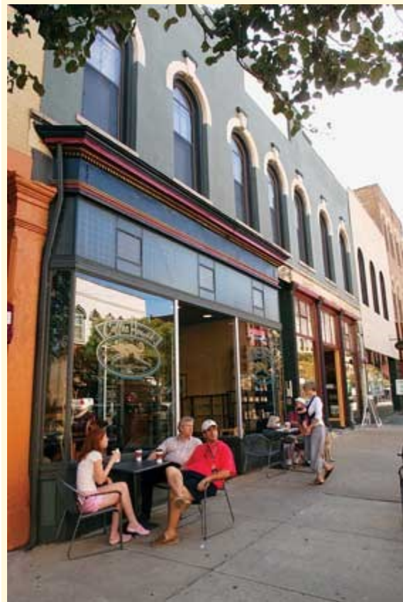
Figure 1 - Sidewalk café located near building to allow safe pedestrian access.

Encroachments may be allowed where it can be determined by the City that the encroachment would not result, individually or cumulatively, in a narrowing of the sidewalk such that important functional attrib-