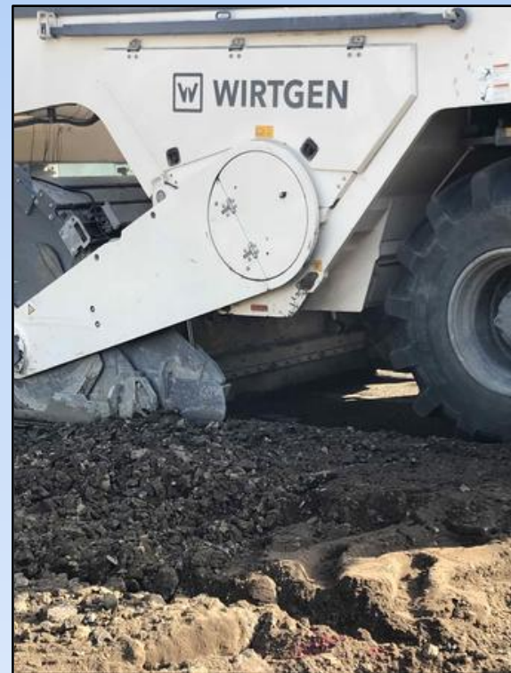
PULVERIZING AND BLENDING MACHINE