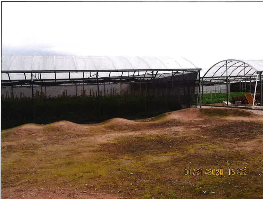
The above greenhouses, located at 1552 Casitas Pass Rd (APN 001-060-040) have a pending permit (19CDP-00000-00058) to utilize these open-sided "mixed light" structures for cultivation of cannabis.