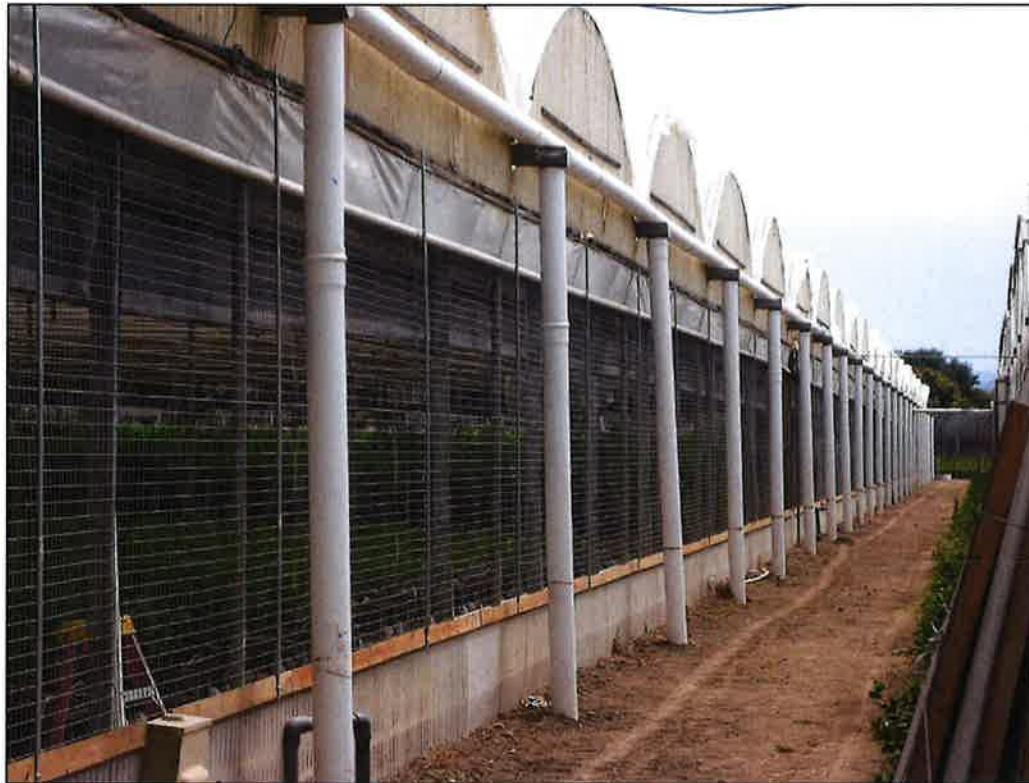
The above open-sided greenhouses located at 1296 Cravens Lane are currently being used to cultivate cannabis under the County's Article X provisions and a State Provisional license.