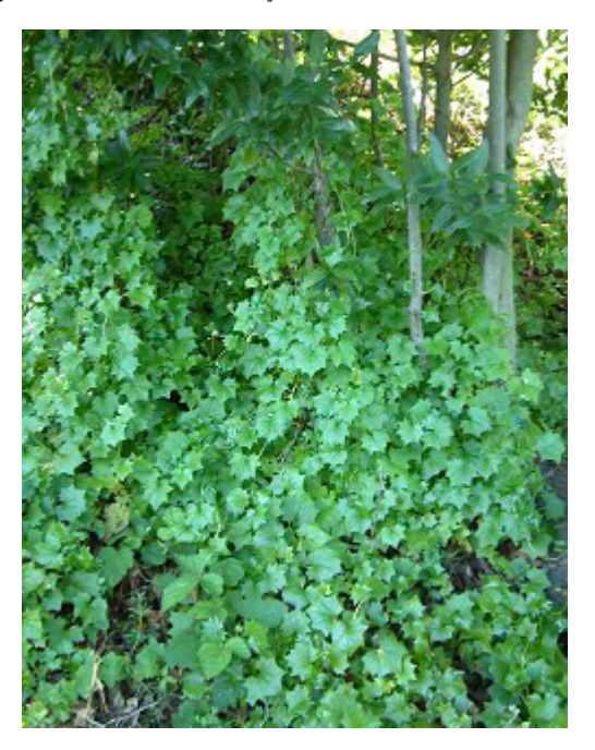
Cape ivy in Berkeley hills (B. Case)

These Plant Assessment Forms (PAFs) include draft scores and documentation for plants reviewed for the updated California Invasive Plant Inventory (a.k.a. the Cal-IPC weed list). The meaning of each score can be found in the Cal-IPC List Criteria (pdf file). These rankings should be considered preliminary until final comments have been received. To view a summary of scores, documentation levels, and Jepson regions invaded for all reviewed species, see the following spreadsheets: