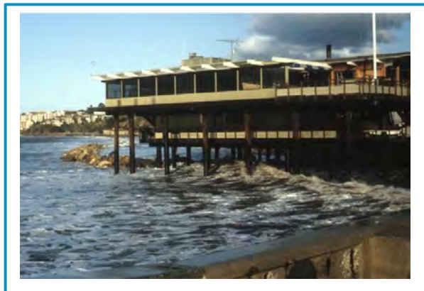
Example of accommodation approach. The Santa Barbara Yacht Club is elevated above the shoreline using caissons, water-tight pier structures. The parking lot and beach flooded during the 1983 El Niño event.