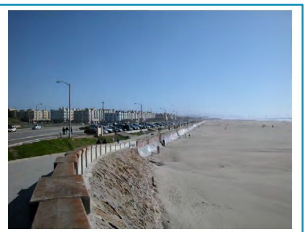
Example of hard shoreline protection. Portions of San Francisco's Ocean Beach is partially armored by a concrete seawall and supplemented with regular beach nourishment.

Although the Coastal Act provides for potential protection strategies when required to serve coastal dependent uses or for "existing development" in danger of erosion (i.e., California Coastal Act Section 30235), it also directs that new development be sited and designed to not require future protection that may alter a natural shoreline (California Coastal Act Section 30253). It is important to note that most protection strategies are costly to construct, require increasing maintenance costs, and may result in consequences to recreation, habitat, and natural defenses. The following options are considered protection strategies and are listed within the CCC Sea Level Rise Policy Guidance: