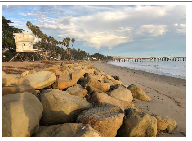
Rock revetments at Goleta Beach have become exposed following severe winter storms, impeding vertical beach access while protecting the Park.

A selected adaptation measure may reduce risks to one asset or resource but may affect another resource or lead to unintended consequences (Table 7-2). One of the most controversial trade-offs of adaptation is associated with the longterm preservation of a beach, which often pits private and public interests against each other with strong overtures to social and community iustice inequality. Adaptation trade-offs could include significant alterations to the shoreline and costs, resulting in the loss of beach following construction of a revetment but protection of landward development. Such