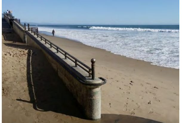
Ramps connecting elevated walkways to the sand at Butterfly Beach in Montecito increase beach access and provide a safe path to traverse the seawall.